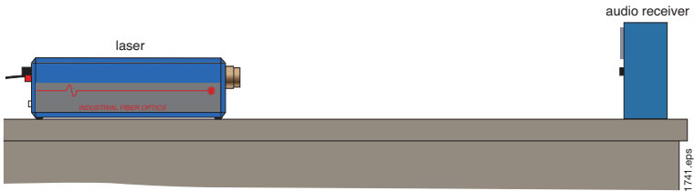
Figure 1. Side view of the laser and audio receiver.